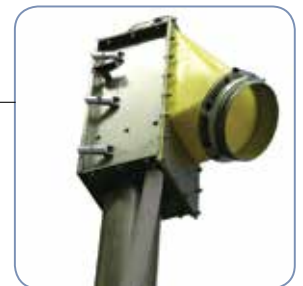
Highly efficient outlet spout in plastic material