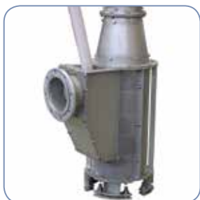
Inlet spout and split screen basket