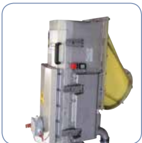
Insulated discharge module