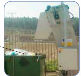
Goose Neck Discharge (OPTION)