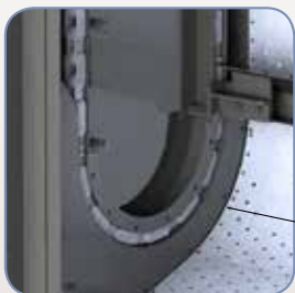
Lower Chain Guide or Lower Sprocket (OPTION)