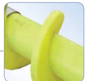
Anti-wear SINT® engineering polymer screw